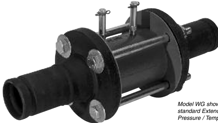
Model WG shown with standard Extended SuperSeal Pressure / Temperature ports